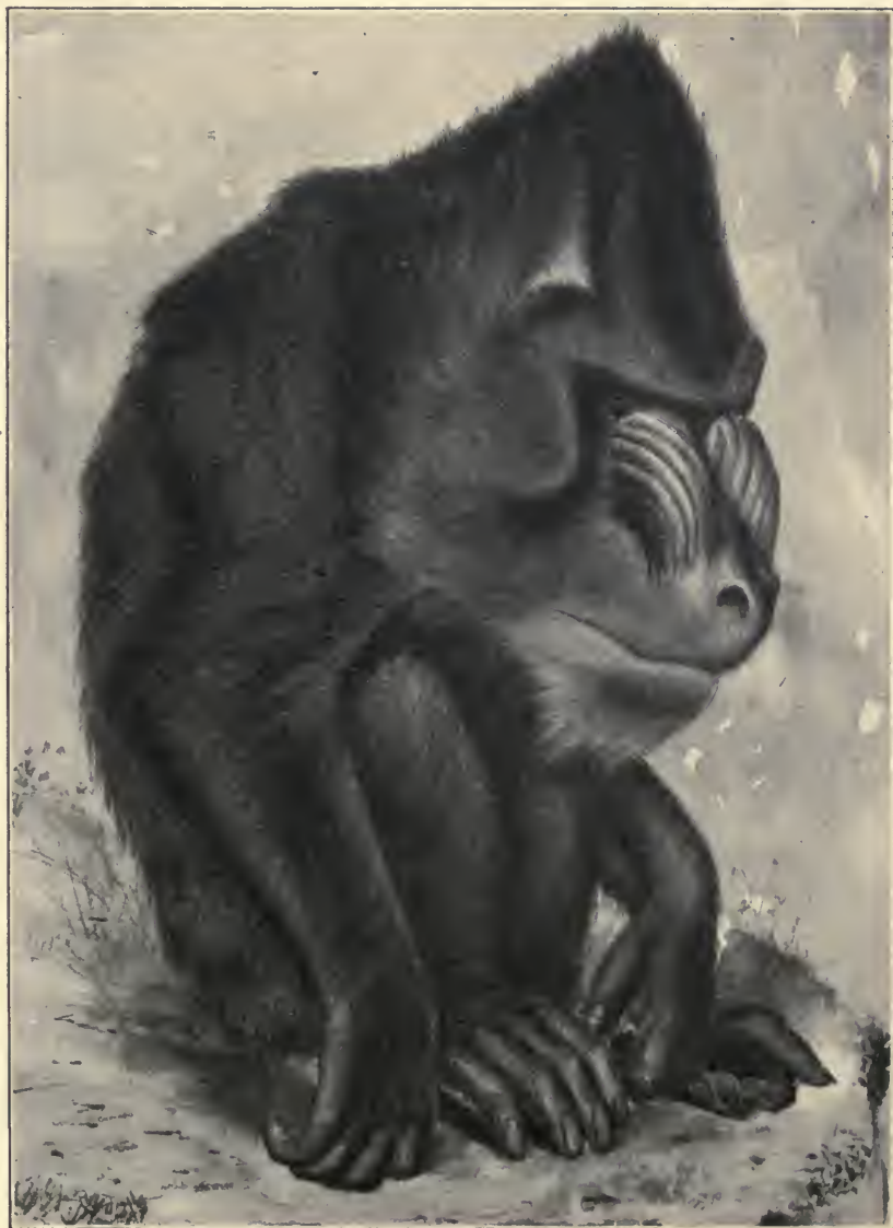
FIG. LXXXVI. PAPIO MAIMON. MANDRILL.